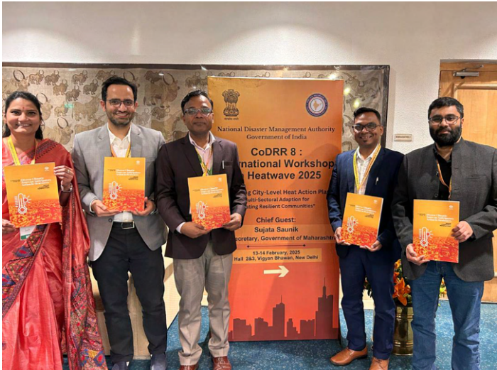
National consultation on Anticipatory Action on Heatwaves and Impact on Communities at Risk