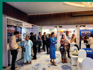
ADRA's booth at IFCCI Conclave