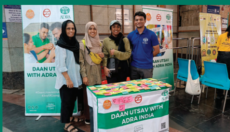
ADRA India's stall at Daan Utsav

Volunteers and staff engaged commuters with an interactive activity, inviting them to write positive messages encouraging women. This simple yet impactful initiative, designed to take just a few seconds of their time, successfully involved passersby without disrupting their routine. The stalls featured vibrant banners and concise information about ADRA India's work, creating an appealing and informative setup.