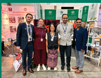
ADRA Asia at APMCDRR