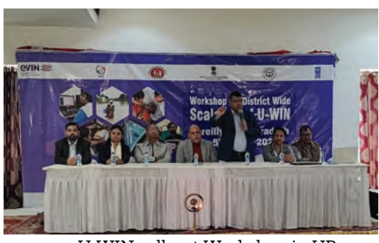
U-WIN roll-out Workshop in UP