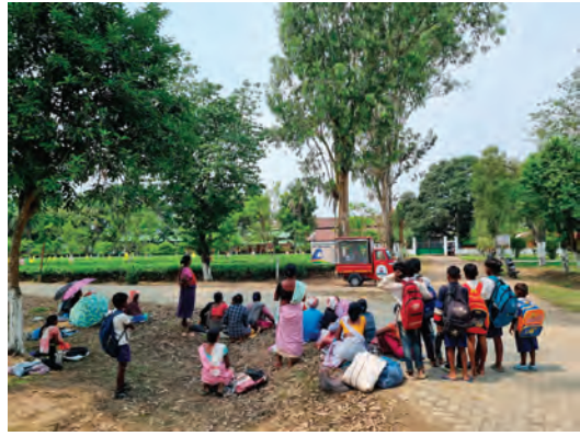
Awareness generation through mobile van screening