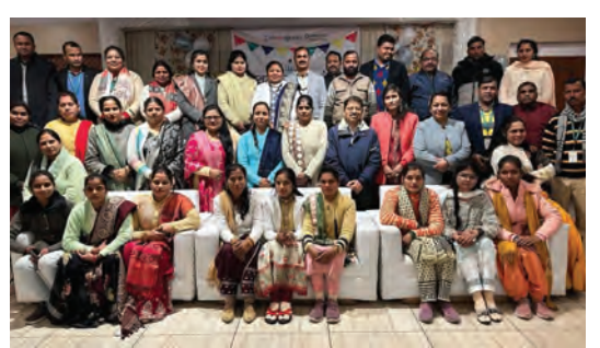
Felicitation event of Mobilization Mitras in UP