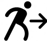
Displaced Populations (Internally displaced & other nationalities)