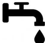
Water Sanitation and Hygiene