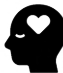
Mental Health & Psychosocial Support