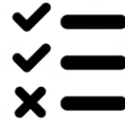
Disaster Risk Reduction & Preparedness