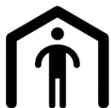
Temporary Shelter & Support