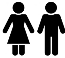
Women & Men