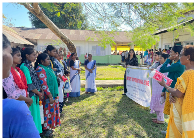
Above: ADRA Staff and volunteers team up with ASHA workers to raise awareness of menstrual hygiene and health