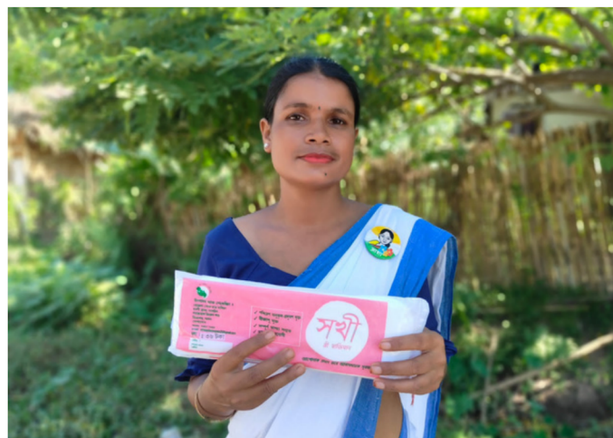
Below: An ASHA worker holds up a Sanitary napkin that was produced at the ADRA supported Sanitary Napkin Unit