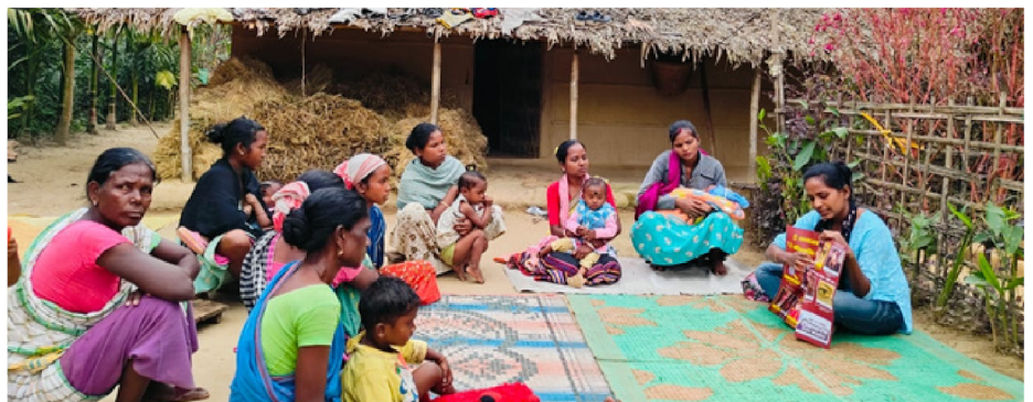
Above: ADRA India continues to reach out to communities in remote locations to raise awareness on health and wellbeing