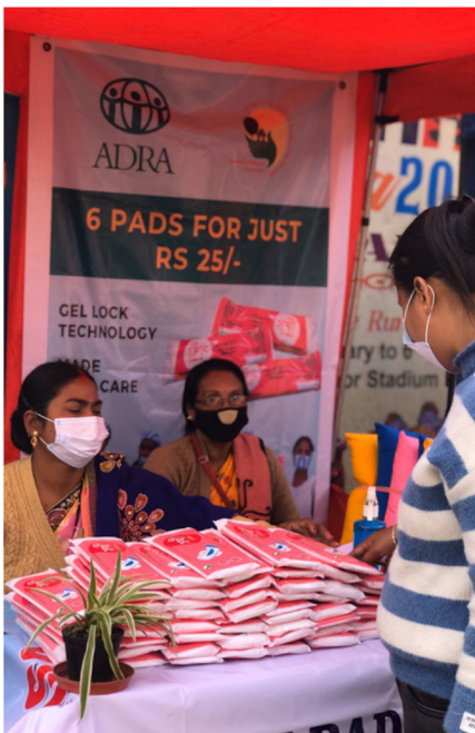
Above: ADRA India continues to empower women and adolescent girls by supporting them through the Sanitary Napkin Unit under the Fresh Hope for Girls Project