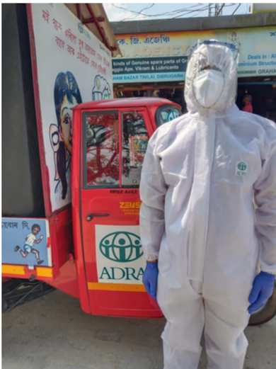
Above: ADRA India's Infotainment van spread awareness on COVID-19 and Vaccination through Audio and Visual messages that were specially catered to the Tea garden workers

Supported by USAID, this emergency project benefited 60 tea gardens in Dibrugarh and Tinsukia, specifically Lahowal, Tengakhat, Guijan, and Hapjan blocks. ADRA India formed Community Action Groups and engaged youth to aid during the pandemic, intensifying vaccination drives. Collaborating with NHM, the project enhanced health worker capacities, conducted awareness through an infotainment van and deployed 60 Mobilisation Mitras across intervention tea gardens. In addition, ADRA undertook COVID-19 response support for Routine immunization and capacity building.