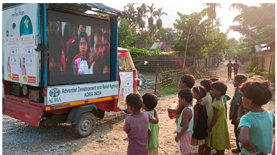
Right: The Infotainment Van- lovingly called the 'Lal Gaadi' continues to make an impact on communities by raising awareness on topics such as vaccination and more.

The organization's holistic approach involves empowering women and adolescent girls through education and sustainable livelihoods. ADRA India has played a pivotal role in enhancing women's menstrual health by establishing a Sanitary Napkin Unit. This initiative provides livelihood opportunities to local women, sustainable sanitary solutions, and actively works to destigmatize menstruation in the community. In response to emergencies like the COVID-19 pandemic, ADRA India has been proactive in supporting tea gardens with vaccination drives, health worker capacity building, and mental health initiatives.