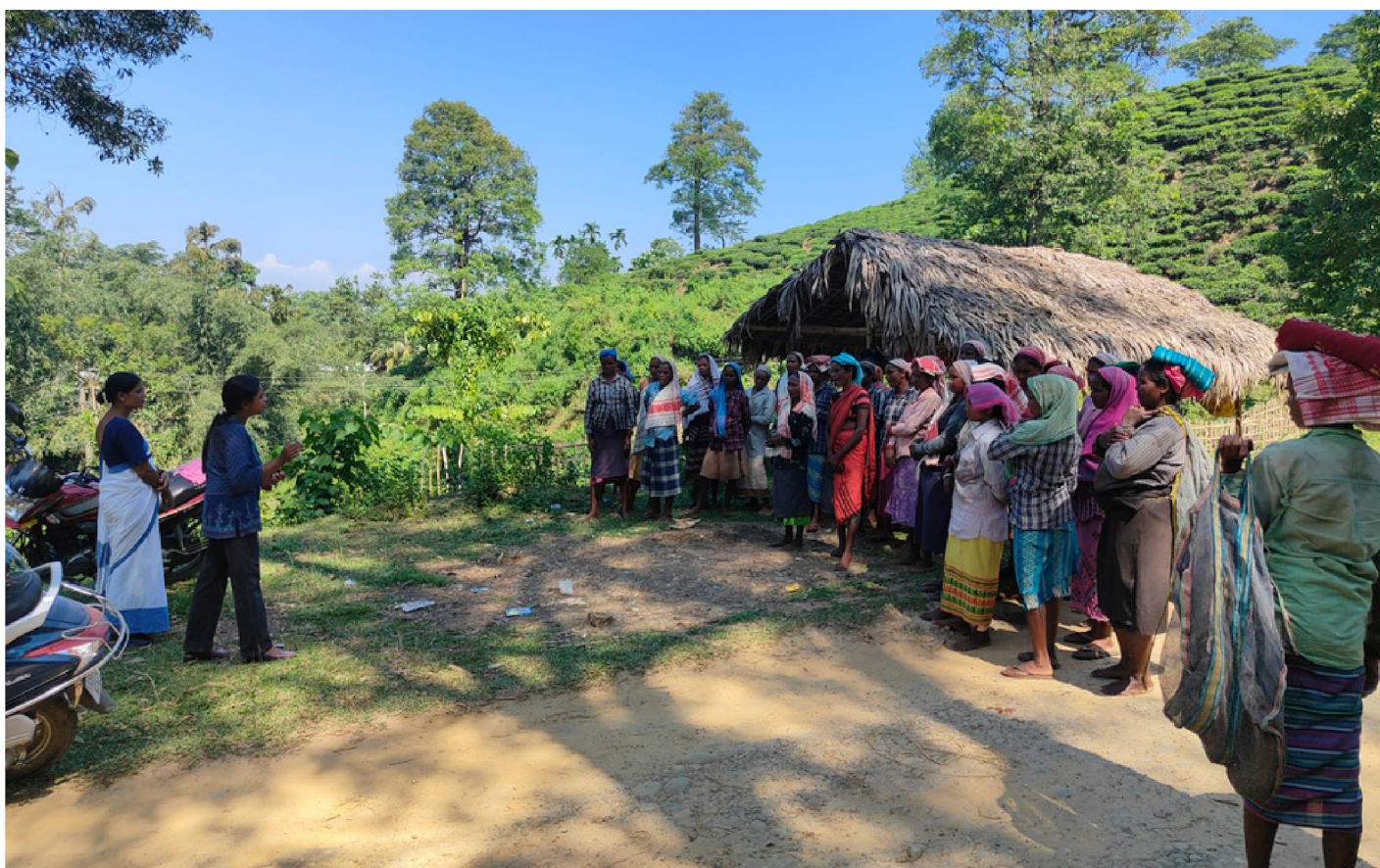
Above: ADRA Staff and ASHA worker meet with a tribal community to speak on health