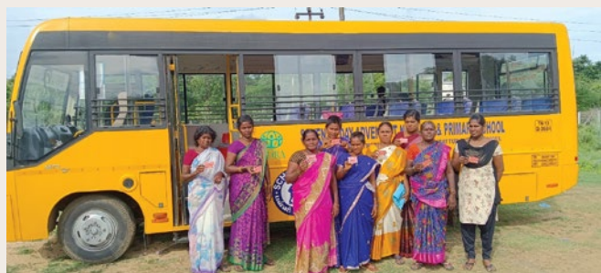
Women posing with their healthcare cards

ADRA India was faced with a critical challenge in one of the communities it works with in Tamil Nadu. A large portion of the community members lacked health insurance cards in Thiruvallur Districts. These cards are of utmost importance for individuals to access quality healthcare services. Recognizing the urgency of this issue, ADRA India decided to take action to address it.