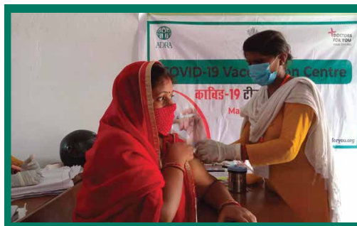
A beneficiary received COVID-19 Vaccine shot at a centre run by ADRA in Patna