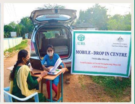
A Mobile Drop-In Centre for refugees Operated by ADRA