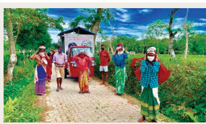
Tea garden workers in Assam standing with E-Rickshaw run by ADRA to create awareness on COVID-19

New Delhi, May 26 2020: The Adventist Development and Relief Agency (ADRA) in India mounted its response to COVID-19 by supporting select hospitals across India with critical medical supplies and several oxygen generation systems to ease the country's COVID-19 health crisis.