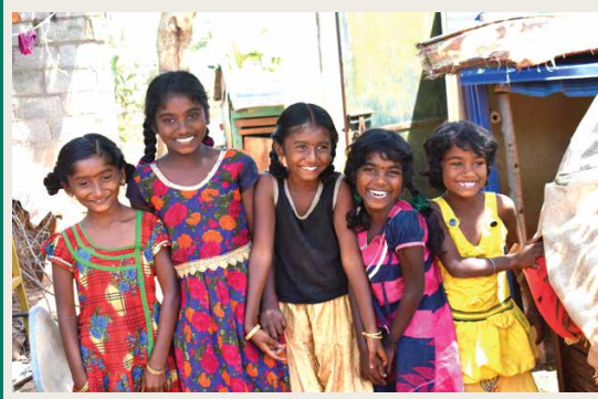
Children at a refugee camp posing for photo

Through Local Economic and Social Strengthening (LESS) Project, ADRA works to provide education and livelihood opportunities, access to credible documentation and guidance & support on voluntary repatriation to Sri Lankan refugees in Tamil Nadu. In this quarter, despite the lockdown, ADRA continued to offer service assistance along with facilitating durable solutions for the Sri Lankan Camp and Non-Camp refugees. In addition, it continued to operate its toll-free helpline and shared credible information for refugees in need.