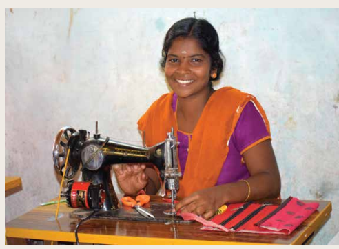
Livelihood opportunities given to refugees by ADRA