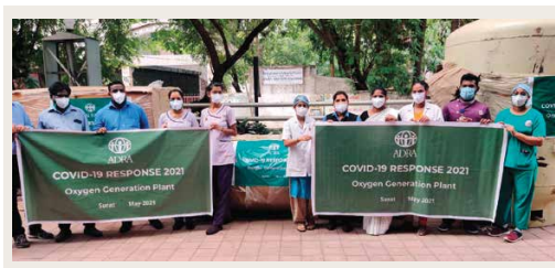
Staff at the METAS Hospital in Surat posing with the Oxygen Generation Plant