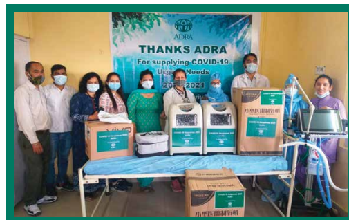
Staff at Shimla Sanitarium and Hospital thanking ADRA for donating medical equipment