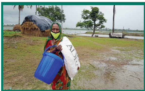
A woman impacted by Cyclone Yaas showing her relief material donated by ADRA