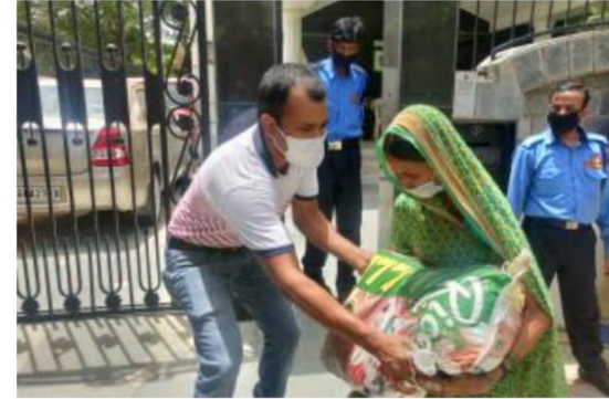
Sample list of grocery items per bag