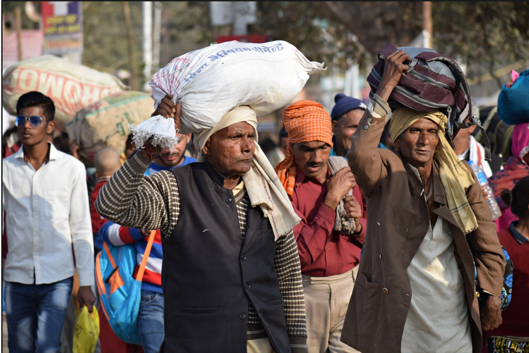
Daily wage workers attempting to migrate back to their hometowns after losing their jobs

COVID-19 pandemic hit India in February, 2020 and by March the virus was spreading rapidly across the country. To curb the spread, the government announced a nationwide complete lockdown on 22 March, which was in effect until May 31, post which the restrictions were eased in a phased manner.